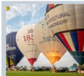
Bristol Balloon Fiesta 10th-13th August