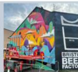
Upfest - Bedminster & Southville