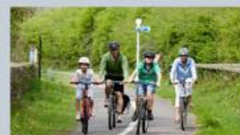
Bristol to Bath Cycle Path