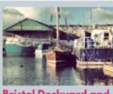
Bristol Dockyard and Visitor Centre