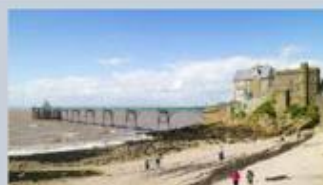
Clevedon Beach & Marine Lake