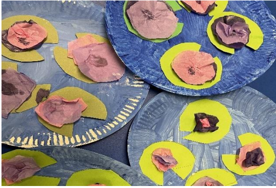
Year 2 lily pad artwork inspired by Monet.

The children across the school have thoroughly enjoyed a day of art today. Each class has found out about their teacher's chosen famous artist and then created art inspired by them.